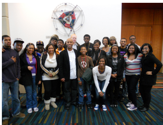
Youth Reflections on Revolution

were on the mountain with Him when they saw His body amazingly changed. Because of the wonder of the moment they suggested building a shrine to remember and document the experience. Amazingly, the scene quickly moves to them traveling back down the mountain with Jesus. During Revolution each of you experienced great life changing moments. Each of you may be tempted to stay on this mountain of experience but Jesus is inviting all of us to move towards "Next" and share our transformation with the world through the way we live.